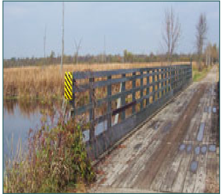
WIOUWASH Trail RR trestle at the Rat River Preserve

Any person owning, occupying, or controlling any lot or yard within a Recorded Subdivision Plat shall remove or cut untended and unmanaged weed or grass growth which has grown to a height greater than ten (10) inches.